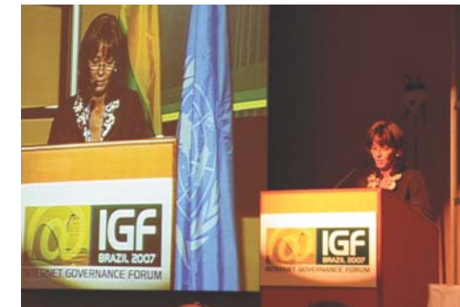
Lynn St. Amour addresses the Opening Session at IGF Brazil 2007.

ISOC's commitment to global Internet education continued in 2007 primarily through its support of a wide range of educational programmes, including two SANOG meetings, AfNOG 2007, AfriNIC-6, MENOG 2, PacNOG 3, and WALC 2007. ISOC continued its long-standing effort to promote development of the Internet by hosting a regulators forum at PacINET 2007 in conjunction with its Pacific Islands Chapter (PICISOC). ISOC Chapters made a considerable contribution to ISOC's education efforts through such events as the Australia Chapter's IPv6 summit, PICISOC's PacINET, and ISOC's France Chapter-organized Egeni meeting. In addition, ISOC held two