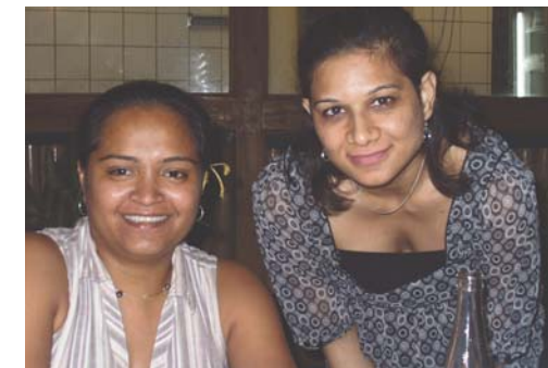
PacINET 2007, Solomon Islands.