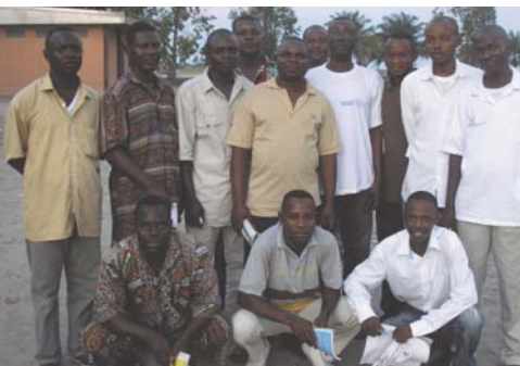
Members of ISOC's Congo Chapter at Oyo, Republic of the Congo