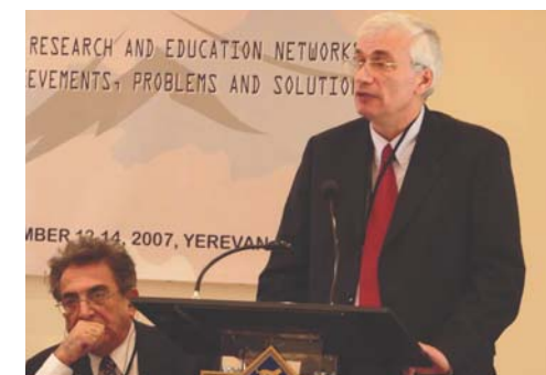
Opening speaker at the Armenian National Research and Education Networks conference, Yerevan, Armenia.

Funds made available by ISOC have enabled the creation of Internet content for nongovernmental organizations (NGOs) promoting human rights in the Democratic Republic of the Congo. As part of the grant, six members of ISOC's Democratic Republic of the Congo Chapter will train to be Webmasters in collaboration with ISOC's Burundi Chapter , whose 15 members also benefited from the training, which took place in Bujumbura. ISOC's support helped finance the trainer, who came from Cameroon, as well as the participants, who were from Congo. The six participants from Congo are currently creating content for 12 NGOs working in the area of human rights in eastern Congo.