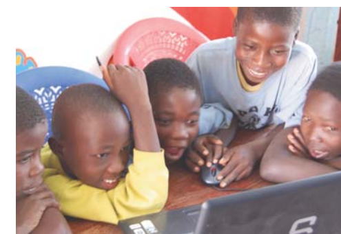
Tanzanian children explore the basics of computers and Internet access.